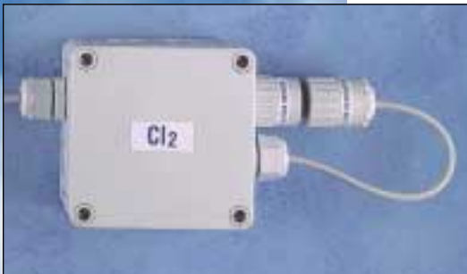
Transmitter with auto-test