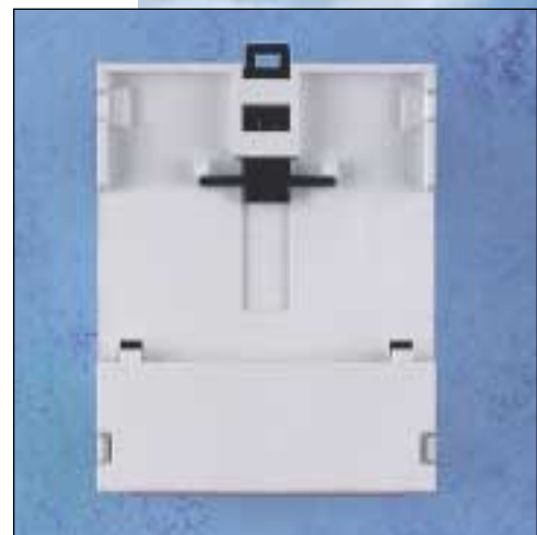
DIN rail mounting