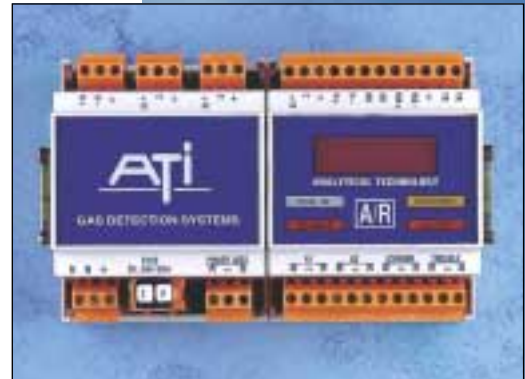
Power supply & receiver