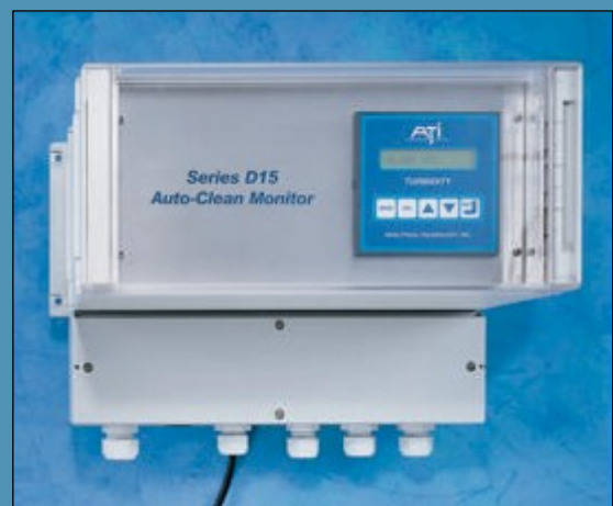
Auto-Clean Turbidity Monitor