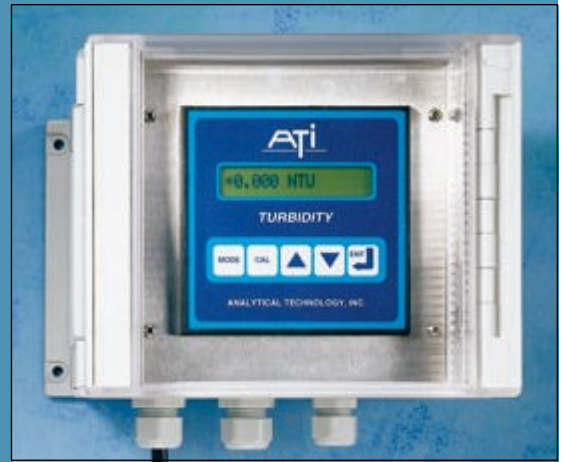
NEMA 4X Monitor

Because turbidity measurement is often required in wastewater effluents and other applications where sensor fouling can be a major problem, ATI offers a special turbidity unit, the D15/76 system, that uses an "air-blast" sensor cleaning system that automatically cleans the sensor as often as necessary to maintain reliable measurements. This system is used only for submersion applications only, and all air supply components required for the cleaning process are supplied in the NEMA 4X monitor package.