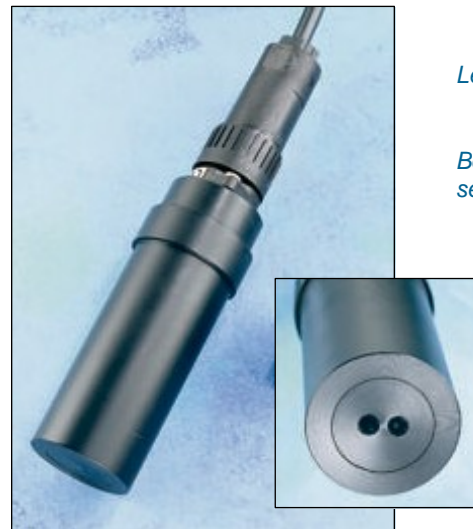
Left: Turbidity Sensor